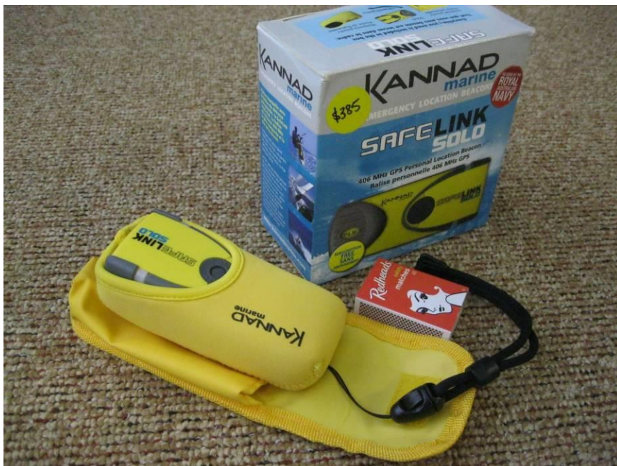
There are different PLBs available

Locator Beacon (similar, but not the same as an EPIRB). They now operate within Australia only on 406 MHz and these beacons can be and should be registered with the Australian Maritime Safety Authority so that your beacon can be tracked in case of emergency.