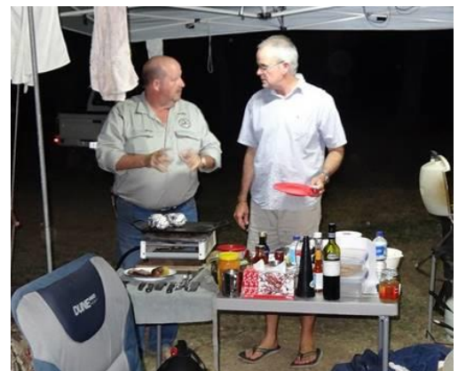
Sharing a meal

Some of these members were first time hunting companions. Team spirit and generosity shows when people get together. It was a great time to spin yarns, relax and build lasting friendships between CWM members. During these times we share our combined experiences and discuss a wide variety of topics while looking at stars in the night sky that can only be really seen away from the city lights.