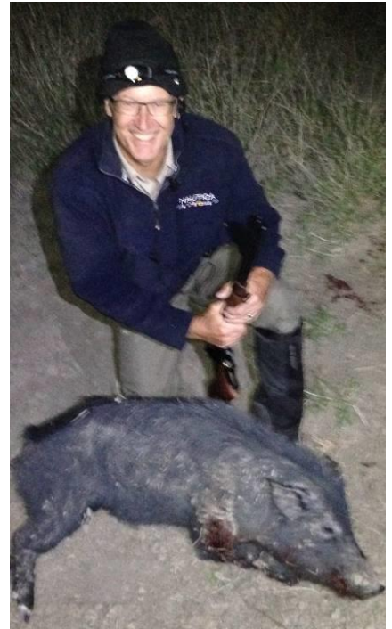
My running boar

site on a Marlin 336 in 30-30 calibre with a running boar shot through the shoulder at about 50 meters.